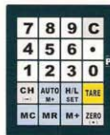
20 key multi-function