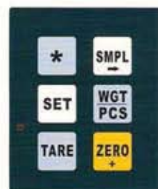
simple counting function